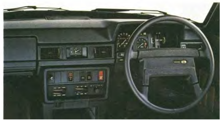
The instrumentation includes a comprehensive system of warning and reminder lights.