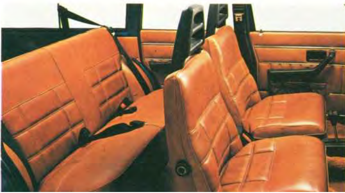
You sit on real leather in the 265 GL. There's plenty of room for five as well as 42 cu.ft. of luggage.